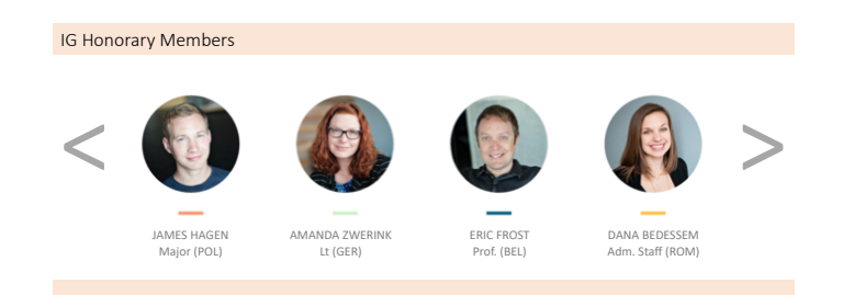
Fig 2. IG Honorary Members page mockup (image adapted from inspirationui.com)

This part of the page will present a short bio and a photograph of the honorary member of the Implementation group. There will be a link to the name of the person to a more detailed achievements page with relevant information and files. If the number of the IG Honorary Members does not fit in the page a scrolling mechanism will appear for facilitating browsing through the members profile similar to the screen that appears in Fig. 2.